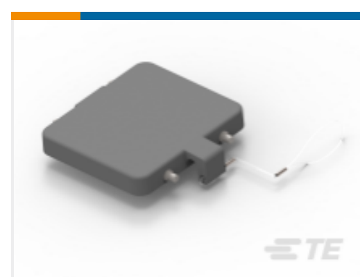
TE Part # T1000321320-000 H32B-KDBP-BOM