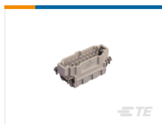
TE Part # T2040323101-000 HE-016-MS 17-32